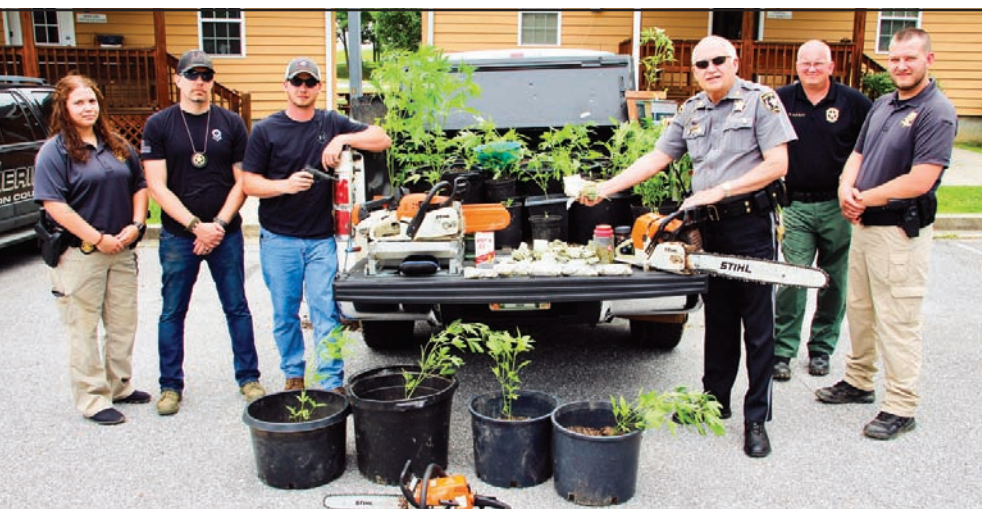
Narcotics investigators with the Union County Sheriff's Office confiscated 70 pot plants, a firearm, cash and stolen items at a residence off Patterson Lane last week.